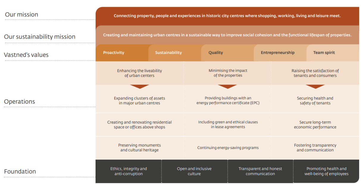
Figure one The Sustainability framework of Vastned

Vastned has set up a sustainability framework, as can be seen in figure one, that links its financial and non-financial objectives. Hereby, Vastned considers sustainability in the broadest sense as an integral part of its mission, strategy, and organisation. As a leading player in the commercial real estate market in historical city centres, Vastned takes its responsibility to contribute to the quality of life and the preservation of cultural heritage of historic inner cities. By continuing to invest in cultural heritage, Vastned extends the functional lifespan of these properties while contributing to the attractiveness of city centres. Due to ongoing urbanization, it is important for society that the housing stock in historical inner cities is expanded. Through converting empty spaces above shops into residential units, city centres are livelier after closing time, which enhances social cohesion and the feeling of safety. Part of the commercial real estate buildings in Vastned's portfolio are already energy efficient. However, Vastned is aware that improvement can still be made in its portfolio and, hence, aims to increase (transparency of) the energy efficiency of its assets. Vastned also aims to reduce the environmental impact of its own operations, for example by minimising the carbon footprint of offices and travel.